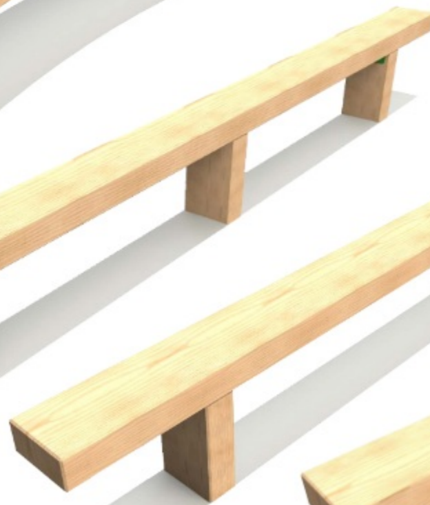
2.4m Sleeper Bench L 2400 W 195 H 420mm