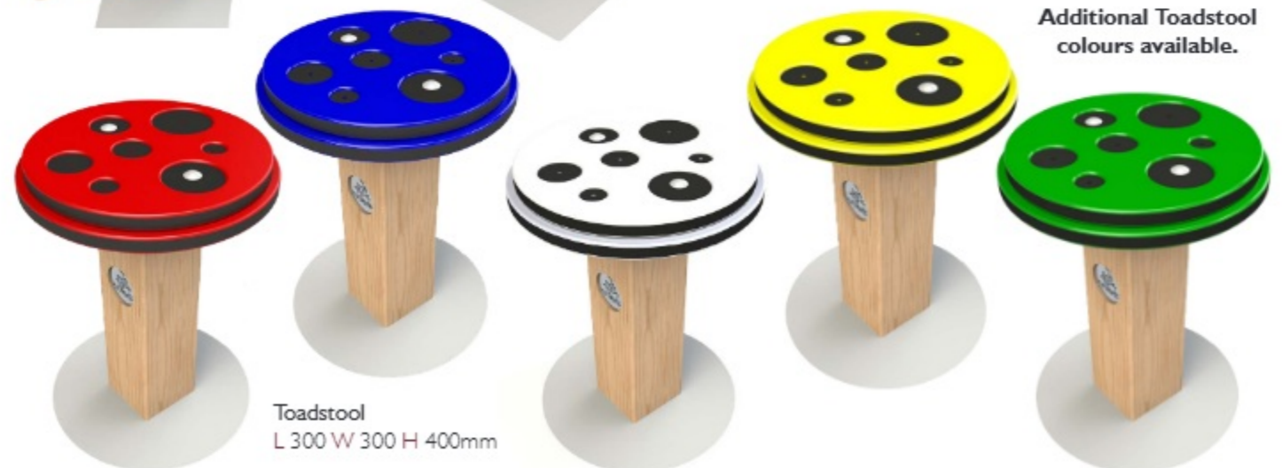
Toadstool L 300 W 300 H 400mm