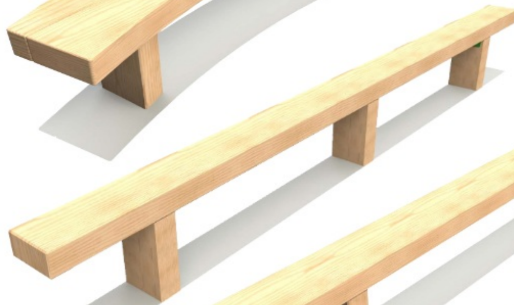
3.6m Sleeper Bench L 3600 W 195 H 420mm