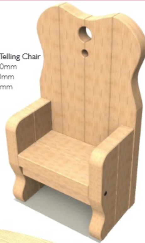
Story Telling Chair H 1400mm W 780mm D 485mm