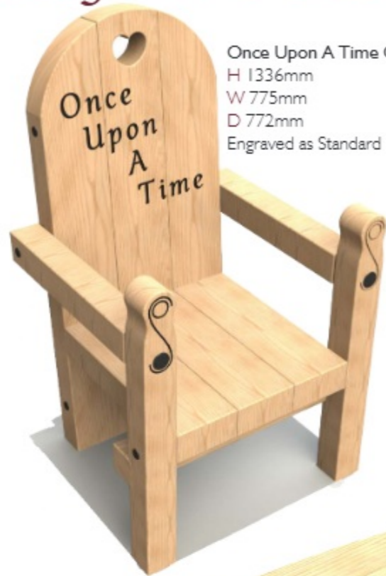
Once Upon A Time Chair H 1336mm W 775mm D 772mm Engraved as Standard