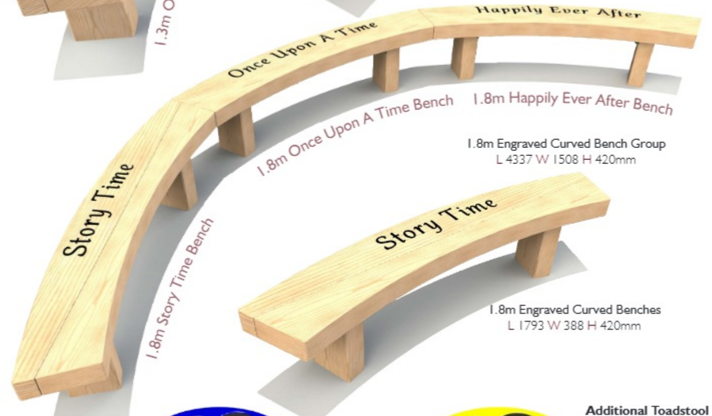
1.8m Engraved Curved Bench Group L 4337 W 1508 H 420mm