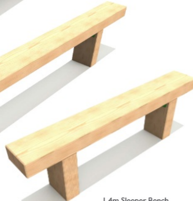
1.4m Sleeper Bench L 1400 W 195 H 420mm