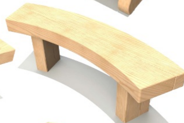
1.3m Curved Sleeper Bench L 1294 W 385 H 420mm