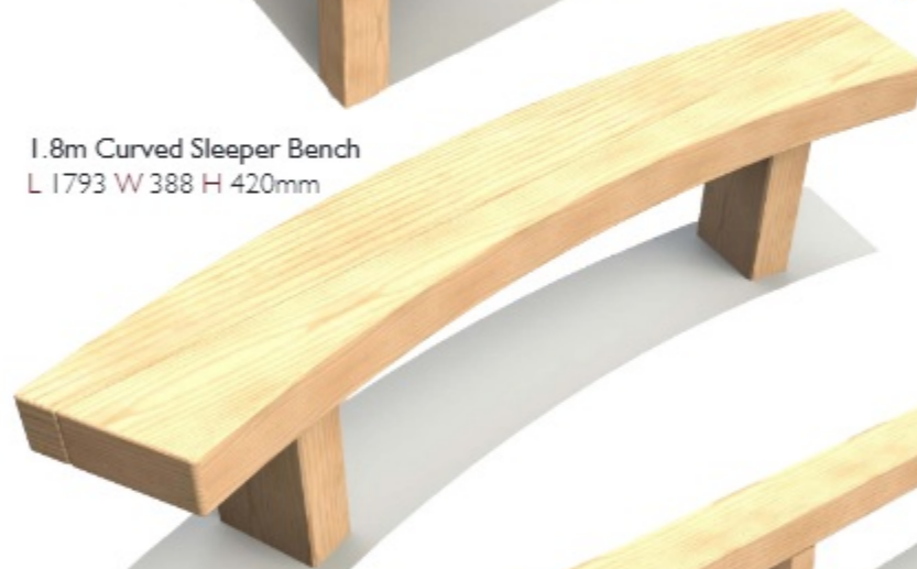
1.8m Curved Sleeper Bench L 1793 W 388 H 420mm